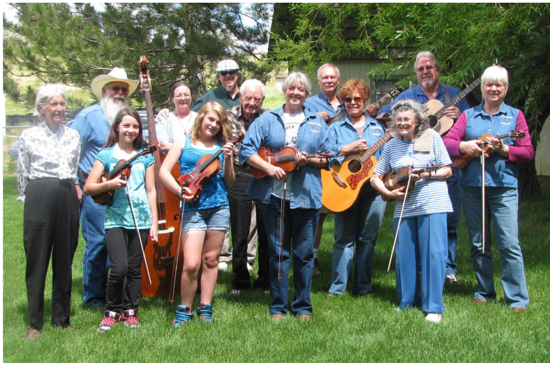
This awards banquet will feature entertainment from the Wyoming Fiddler's Association, District No. 4